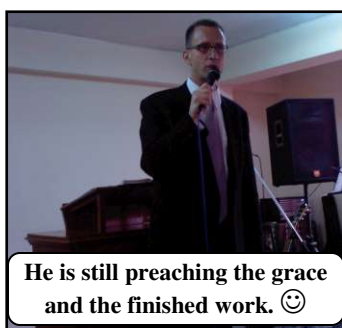
He is still preaching the grace and the finished work. ☺

God is been teaching me a lot about prayer lately and showed me the power of it. Lately I've been visiting this one sister in Christ whose husband doesn't want to draw near to God by going to a church. Every time he started to go to a church, a lot of problems would come upon him. We purposed in our hearts to pray for a month that he would come to Jesus. A week later I visited her and asked her: "Are you still praying? because I am". She said: "Not really, you know, 3 days after you left my husband started to have many problems and he even left the house with some luggage". My heart was jumping with joy, realizing that Jesus was working, but unfortunately she wasn't seeing that, she was looking at the "snake bite". He returned home but he is still resisting the Holy Spirit. I will keep praying for him because I know that his energy will end. God is awesome.