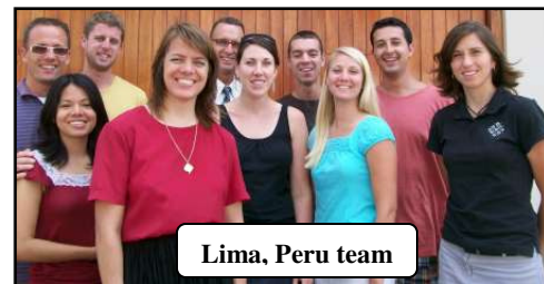
Lima, Peru team

Hello from Peru, First I would like to thank you for your prayers and your generosity in supporting me financially. I really appreciate it and I thank God for you. This summer I didn't go to visit my parents but God gave an even more amazing time with the body here, especially with the girls (u can see the pictures). His plan is perfect. God gave us an amazing team here in Peru and we can see that He began something great here that will spread through all S America. We are excited. Bible College is a big part of it. Please continue to pray for the teachers and students. We are also praying for a Christian day school.